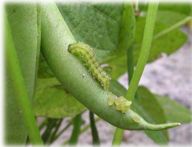
Heliotis on beans